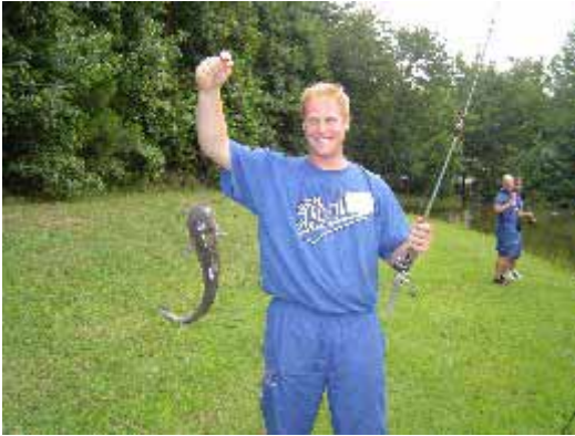
HEY ! LOOK WHAT I CAUGHT