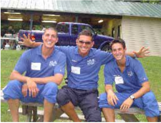
WELCOME TO AMERICA