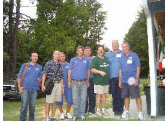
THEY WERE TRYING TO RECRUIT ME