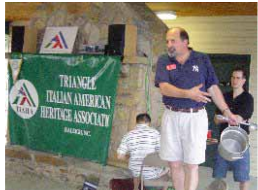
THE PRESIDENT SPEAKS