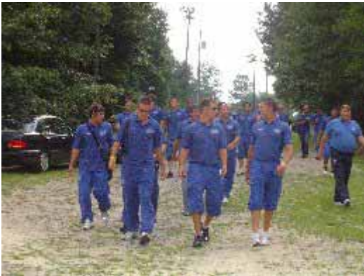
HOW YOU DOIN' ?