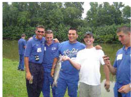
A PRIZE CATCH